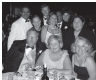
PANA Members gather at the AANA Annual Conference in Orlando in August.